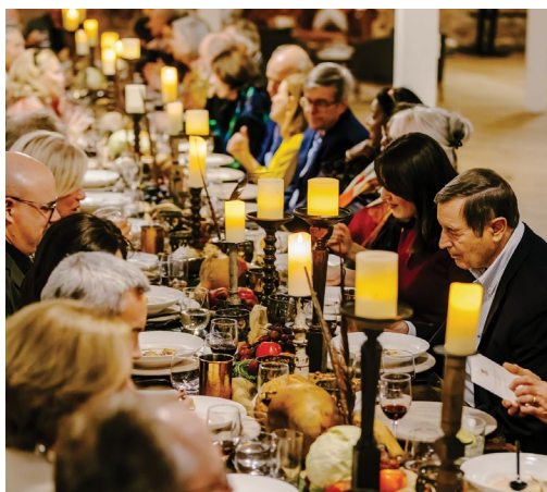
Clinking chalices and soft candlelight at the first-ever CLF Literary Feast spotlighting the work of Bernard Cornwell. (Sold out!)