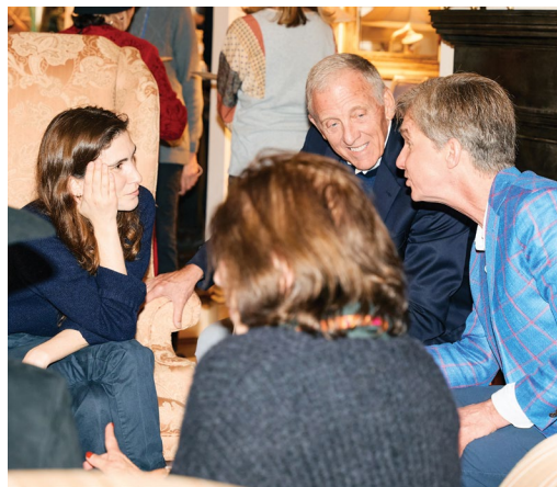
Author Katherine Rundell in rapt conversation with donors at a Charleston Literary Festival donor brunch