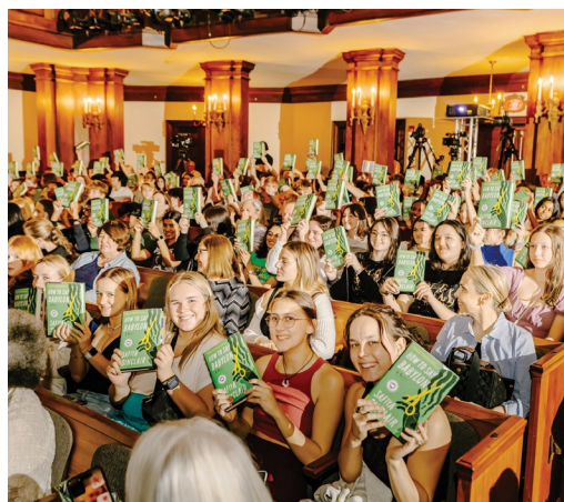
Students raising their copies of Safiya Sinclair's How To Say Babylon - books generously sponsored by a CLF donor